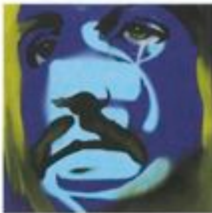
LOVE: 1) John Lennon, 2) George Harrison, 3) Paul McCartney, and 4) Ringo Starr; oil and spray paint on stretched canvas, 10 x 20 inches

high art. Graphic illustrations, music album covers, and graffiti are a few urban inspirations that I incorporate into the traditional form and production of art."